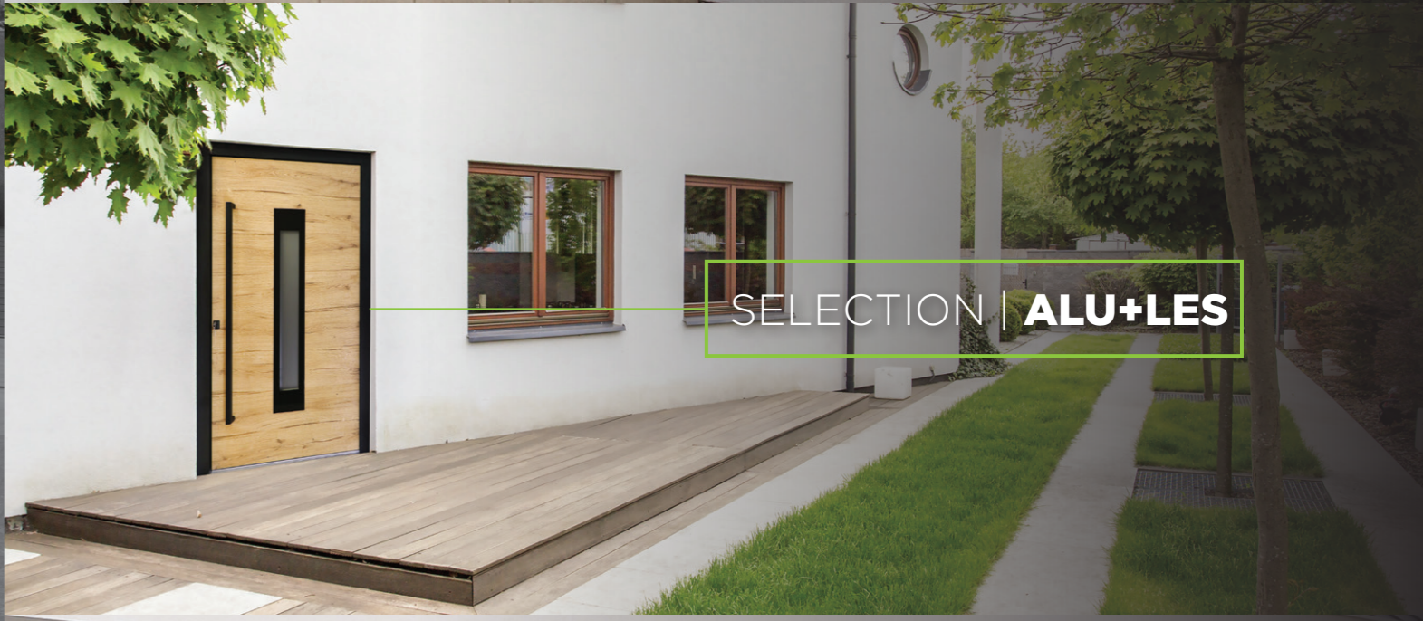
SELECTION | ALU+LES