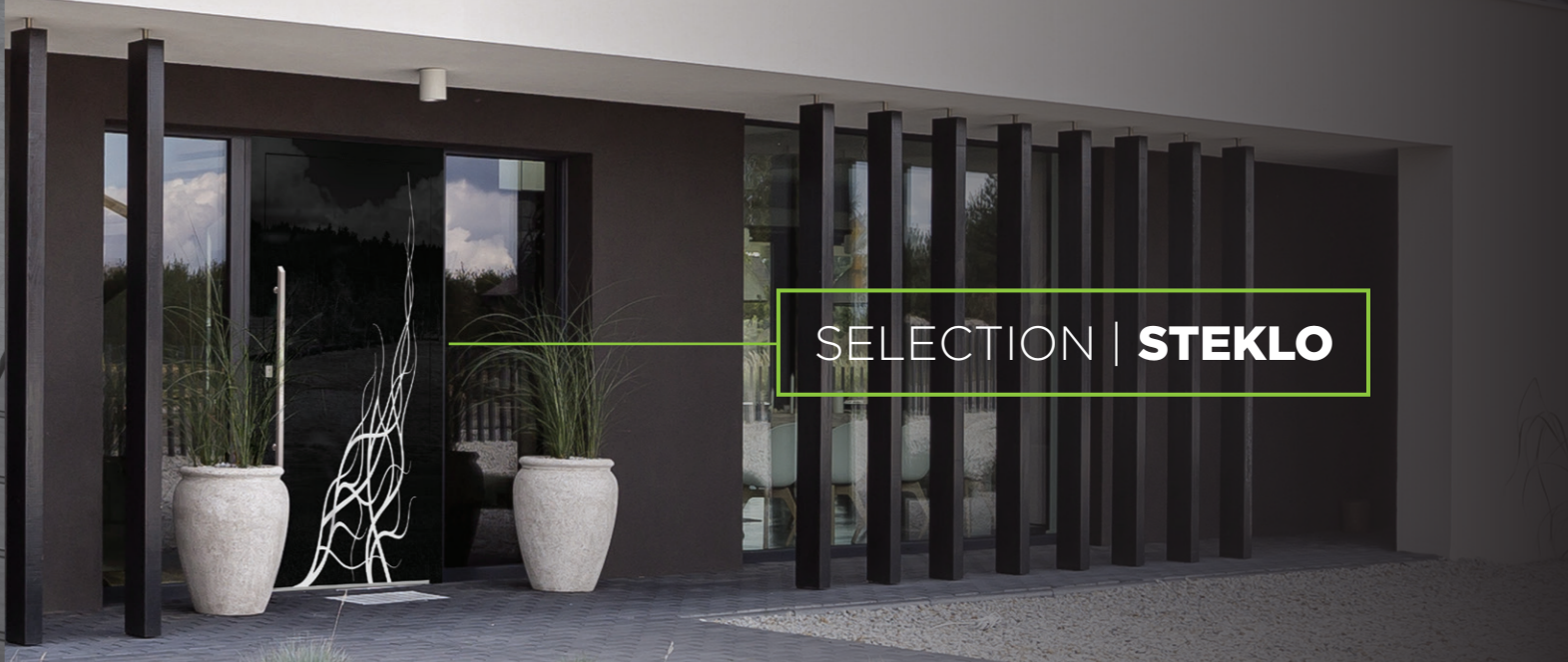
SELECTION | STEKLO