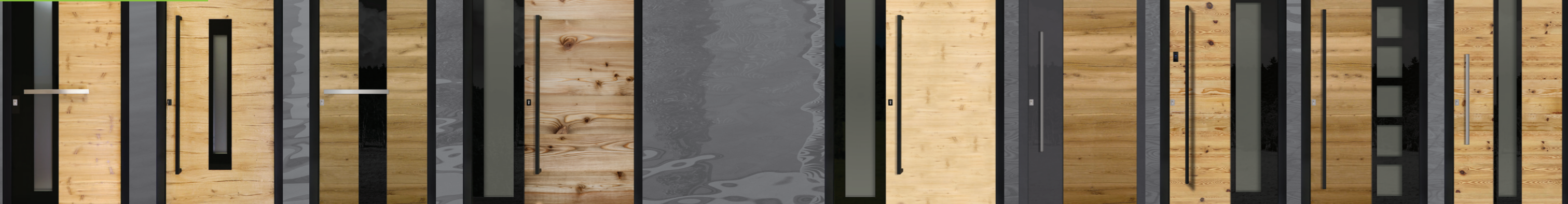
01 02 03 04/A 04/B 05/A 06 07 08