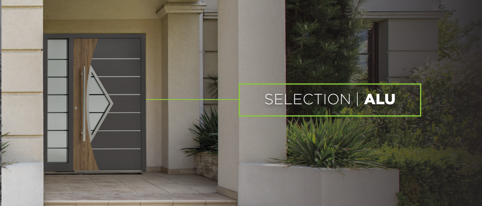
SELECTION | ALU